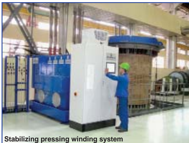
Stabilizing pressing winding system